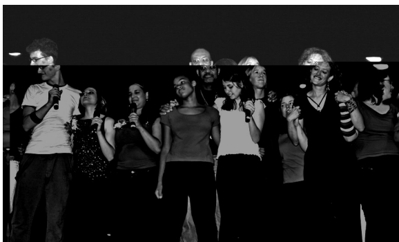
Our annual summer conference leads to a Big Show, with singing, dancing, and a great band. The friendships you make can span the country and can last a lifetime.

In 1965, a summer youth conference at Makinac Island, Michigan, produced a dynamic musical program performed by people from all over the country which became known as Sing Out '65. As they toured the nation, they helped many local groups be formed, and a fresh new movement was born. Sing Out '65 evolved into Up With People, and the hundreds of local groups that had sprung up across the country became known as "Sing Outs" in honor of Sing Out '65. In 1968, Up With People dropped its affiliation with the local groups. National Action Council (NAC) was organized in 1971 by Sing Out members from across the U.S. to keep their groups going and share ideas. NAC changed its name in 1977 to People International.