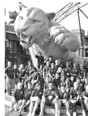
The cast with a Detroit "Tiger" at Comerica Park after singing the National Anthem before a Detroit Tigers baseball game during 2003 Conference week.

In sum, through shared challenges and experiences, PII members create memories and build themselves and each other as the leaders of tomorrow.